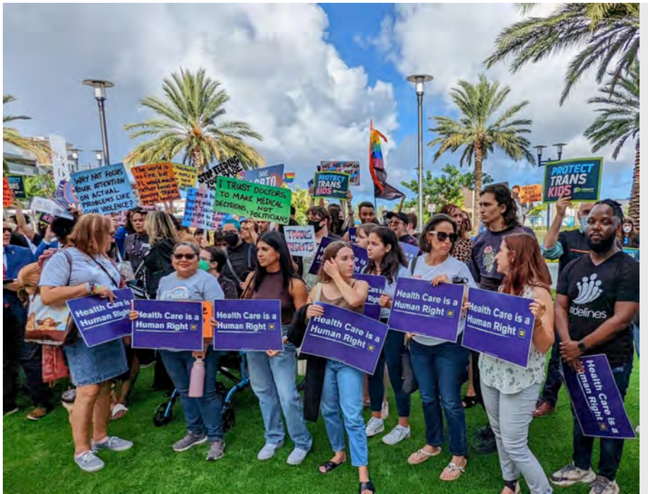
Lawsuit Suggests Zealotry Disguised as Medicine Led to Denial of Medicaid Coverage for Trans Treatments miaminewtimes.com

That much mention of my other qualifications.